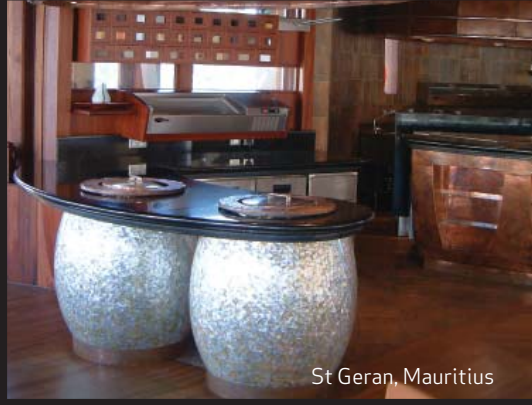
St Geran, Mauritius