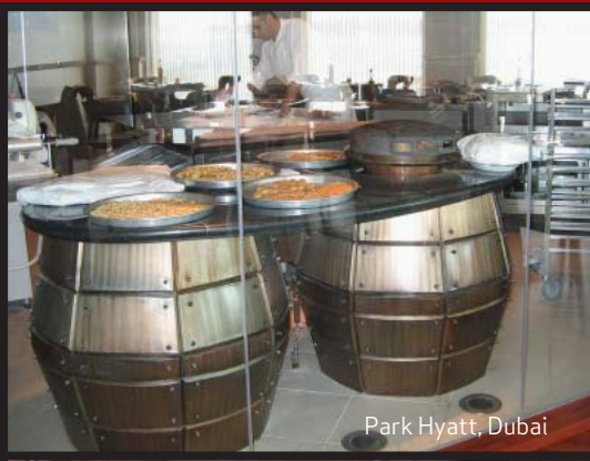
Park Hyatt, Dubai