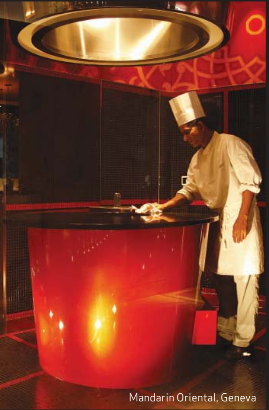
Mandarin Oriental, Geneva